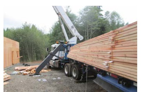
Figure 3. Truck-mounted crane with trusses on the trailer

At approximately 12:30 pm, a truck-mounted crane with a trailer loaded with the trusses arrived at the jobsite. The truck operator provided the foreman with the delivery documents containing the Structural Building Components Association (SBCA) BCSI-B1 Summary Sheet-Guide. He then assessed the area to determine the location where he could set-up the crane to offload and set the trusses in place on the structure one at a time. The driver estimated that each truss was approximately 200 pounds. These trusses were believed to be designed for