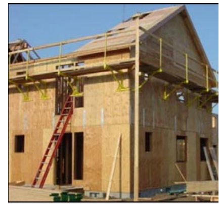
Example 2. Exterior scaffolding on structure.