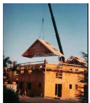
Example 1. Erecting and sheeting a series of trusses on the ground and then lifting the unit into place with a crane.