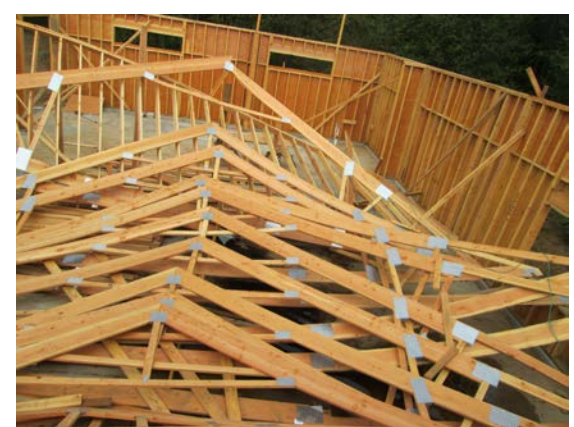
Figure 1. Collapsed trusses where the incident occurred.

A 33-year old carpenter foreman was killed when the roof truss system he and his crew were installing collapsed. The victim was hired to be the foreman for a project to construct a residential shop building. A few days before the incident the crew began framing, sheeting and bracing the external four walls. On the day of the incident, vertical truss bracing (2 X 4's) were nailed to the north and the south wall (see Figure 2). The truss manufacturer arranged for the delivery of the trusses on a trailer pulled by a truck-mounted crane. The truck operator provided the foreman with the delivery packet containing the BCSI-B1 Sumary Sheet-Guide to Handling, Installing, Restraining and Bracing of Trusses (see Reference #7) before setting up to