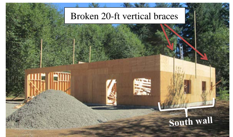
Figure 2 . The shop/garage building with collapsed trusses within the structure. Note the 2X4's nailed to the outside of the south wall and that ground bracing was not erected. Middle vertical brace remained unbroken.

into its place and the temporary short member top chord lateral restraint was installed, the victim disconnected the truss from the rigging. The truck operator and crew member on the trailer saw the truss system collapsing and yelled to warn the crew. The two crew members working on the top plates of the framed walls were knocked off the structure to the concrete floor below and were injured from the fall and falling trusses. The worker on the concrete floor beneath the erected trusses cutting lateral restraints to size sustained a head concussion. The victim sustained a fatal head injury when he was struck on the head by a falling truss.