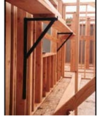
Example 3. Interior scaffolding.

Figure 6. Three construction methods to minimize fall hazards when erecting trusses.