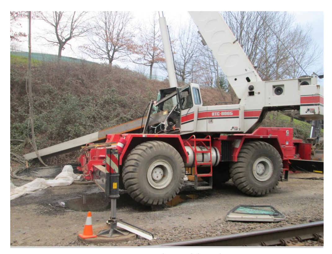
Figure 1. Crane cab struck by H-beam.

A 40-year old crane operator was killed when a 35-foot (5600 lb) H-beam fell crushing the crane cab and striking him in the head. During a pile driving operation, the H-beam pile had been placed in a drilled 25-foot hole. While using a vibratory hammer to force the pile further into the hole, the pile shifted. After several failed attempts to correctly position the pile it was extracted using the hydraulic clamp of the vibratory hammer and moved 12 feet from the hole. It was held in a vertical position with the bottom of the pile resting on the ground. The clamp holding the top of the pile unexpectedly released. The pile was not rigged to the clamp housing or attached to the whipline. The 5600 lb pile fell, struck and crushed the crane cab, and killed the operator.