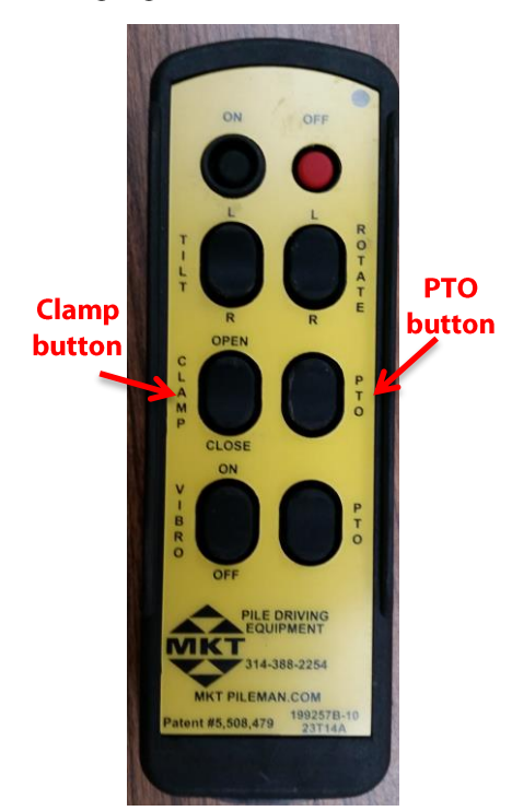
Figure 6. MKT remote control for a vibratory hammer

incident revealed problems with the remote control. Problems, although not described in the documents, were also reported during a previous job.