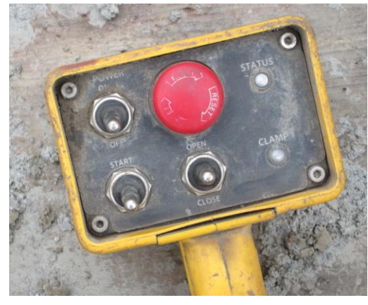
Figures 4 and 5. Vibratory hammer wireless remote control. Below is a drawing with the safety trigger option.

The pile was extracted while it was clamped to the vibratory hammer. The pile did not have a safety chain or line connecting it to the vibratory hammer housing nor was the crane's