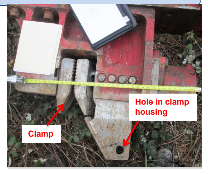
Figure 2. Close up of the vibratory hammer clamp housing.

On February 17, 2015, a crane operator was struck in the head when an H-beam pile that was held in a vertical position by a vibratory hammer clamp, fell, crushed the crane cab, and killed the operator. OR-FACE contacted OR-OSHA after hearing a local news report to confirm incident. OR-FACE completed the investigation report by obtaining the OR-OSHA field investigation documentation, medical examiner reports, police reports, and follow-up interviews with the OR-OSHA