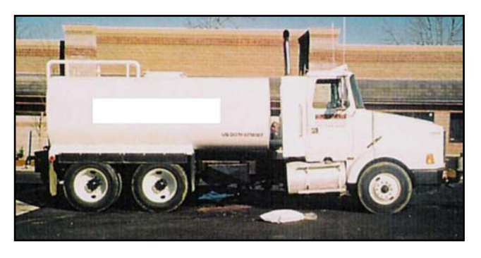
A field mechanic was apparently checking his repair work underneath this water truck when his collar caught and tangled in the rotating power take-off drive shaft.

On February 9, 2006, a 33-year-old field mechanic was killed while repairing a 1989 Volvo water truck at a customer's construction site. The mechanic was dispatched to diagnose and repair a malfunction of the truck's water spray system. Working underneath the truck, the mechanic discovered a kink in the water discharge hose, which he fixed. After moving his tools out of the way, he went underneath the truck again while it was