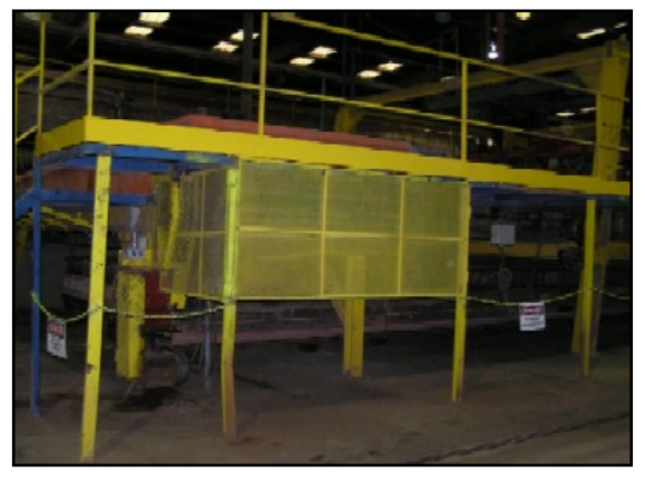
View of stacker shows barricaded undercarriage where incident occurred.

On May 5, 2005, a 55-year-old experienced millwright maintenance mechanic was killed while inspecting repairs to a building materials setting machine. New parts had been installed a week earlier. The repaired machine, commonly called a "stacker," had been operating well for 4 days prior to the incident. On the morning of the incident, the stacker was in operation for 1 hour, and then put into idle mode for a few minutes while the operator added more unfired product by hand. While the stacker was idling, the mechanic entered a barricaded, posted area under the stacker to inspect the stacker's alignment