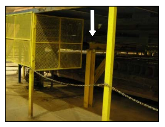
Arrow shows the horizontal crossbeam under the stacker, inside the barricaded area.

When the mechanic reported to work on May 5, the day of the incident, he was informed by the stacker operator that the machine had been operating normally. The operator started up the stacker at 7 a.m. Shortly thereafter, the plant manager walked past the machine and noticed the security gate under the alignment area was open, but no one was in sight. He shut the gate and walked on.