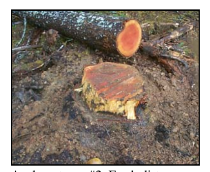
Anchor stump #2. Fresh dirt indicates the stump pulled out of the ground and released its guyline.