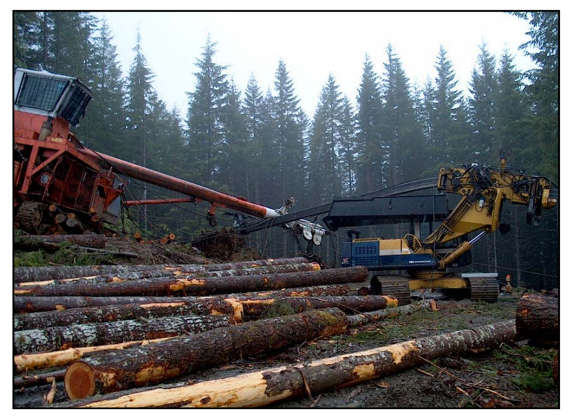
When guyline support failed, the yarder tower fell onto a nearby delimber (right).

On April 18, 2003, a 42-year-old logger, working as a chaser, was killed while standing on the landing site during a cable yarding operation. A Madill 071 yarder was in the process of completing a turn when the tower collapsed. The tower fell on the boom of a delimber that was also operating on the landing site. The force of the impact caused a sheave (cable pulley guide) to sheer off from the side of the delimber's boom. The falling sheave struck the chaser on the head, and punched through his hard hat. Life Flight was