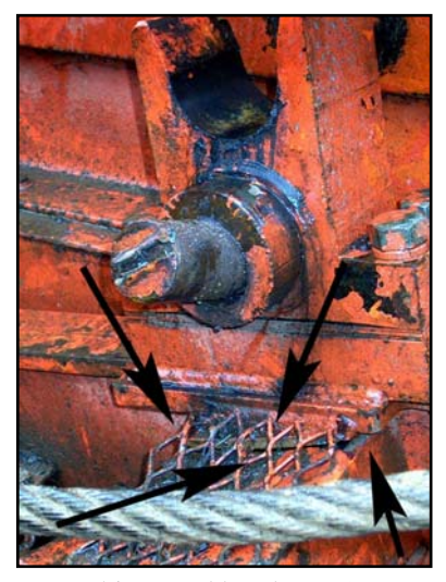
Tower hinge and box beam (arrows) broke, allowing tower to come down.

The crew was sending in a <u>turn</u> of four tree-length logs when the incident occurred, according the OR-OSHA report. The report states that the logs hung up on a stump in the road line, which put stress on the yarder tower. The back-right <u>guyline</u> came off of its stump, which increased pressure on the next stump to its left, and that guyline came off of its stump as well. With two guylines down, the other two guylines could not hold the tower in its upright position.