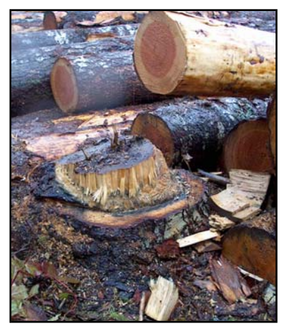
Anchor stump #1. The cable pulled over the top of the stump. Note proximity of log deck to stump (see Recommendation #1).