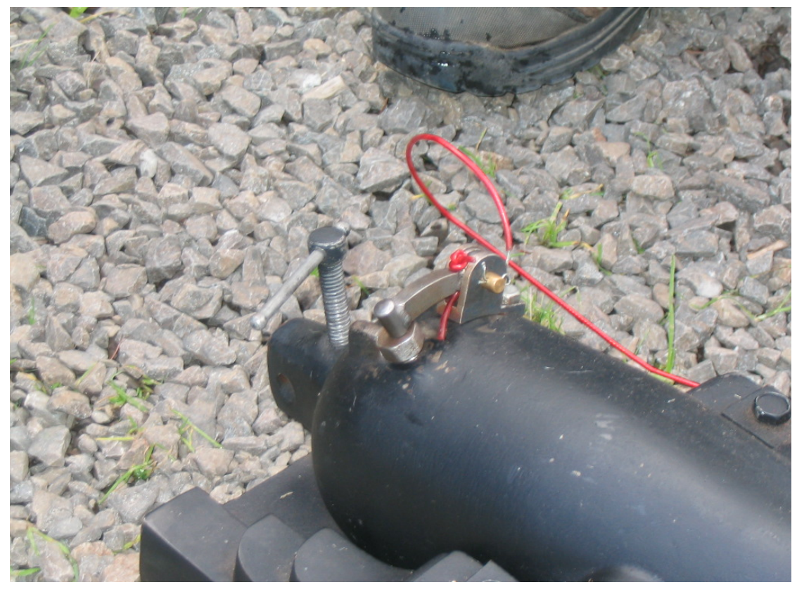
Photo 3. This photo shows a solid steel cannon in use at another of this employer's youth camps. This cannon is equipped with a 'slap hammer' for firing. Problems encountered with other firing methods, i.e., touchstick, fuse, loose powder, etc. are eliminated. The person firing the cannon typically stands 4-5 feet from the cannon and pulls a lanvard to set off a small cap-like primer charge in the cannon's touchhole.