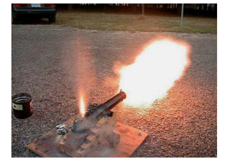
Photo 1. Black-powder salute (no projectile). Note flame from touch hole and muzzle.

On the evening of the incident, the victim set up the cannon as instructed and attempted to fire it during the flag ceremony, but the wind twice extinguished the touch stick used to fire the cannon. After the second attempt failed, the ceremony proceeded without the cannon, and everyone retired for the evening meal. The victim and another youth working as a counselor remained at